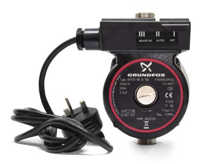
PRODUCT CODE 99539153